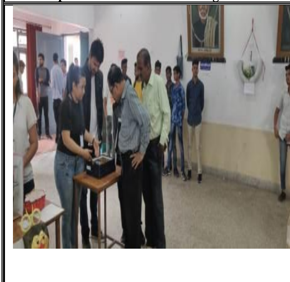
Students explaining the model to faculties