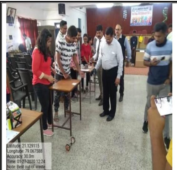
Students giving live demonstration to Principal Sir